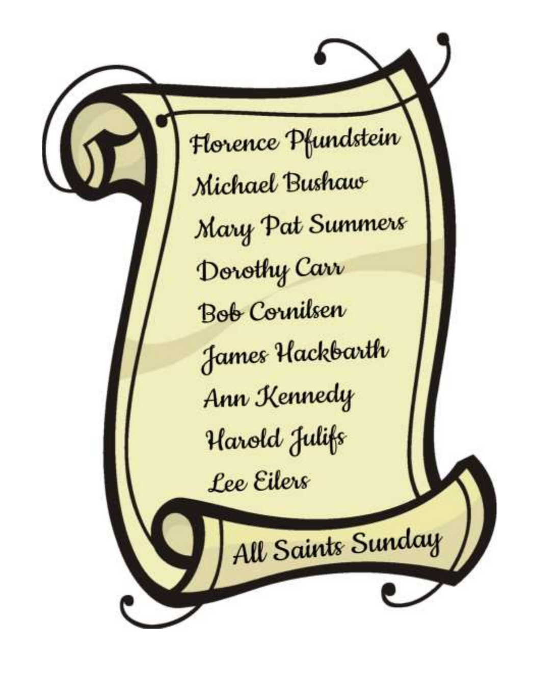
Sunday, November 3, 2024 9:00 a.m.